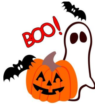
Photo Booth, 50/50 Drawing, Raffle Baskets AND Food

Basket Raffle Donations needed. If anyone would like to put together a basket ($25 value) for Trivia Night, please call the church 1-844-536-6514. Baskets need to be dropped off at the church on Wed. Oct. 19 th . Thank you.